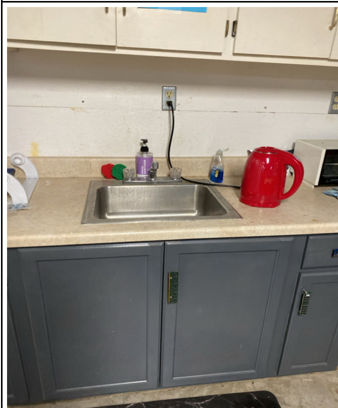
2/7/2024 - 318-3 - Admin Building - Basement Kitchenette