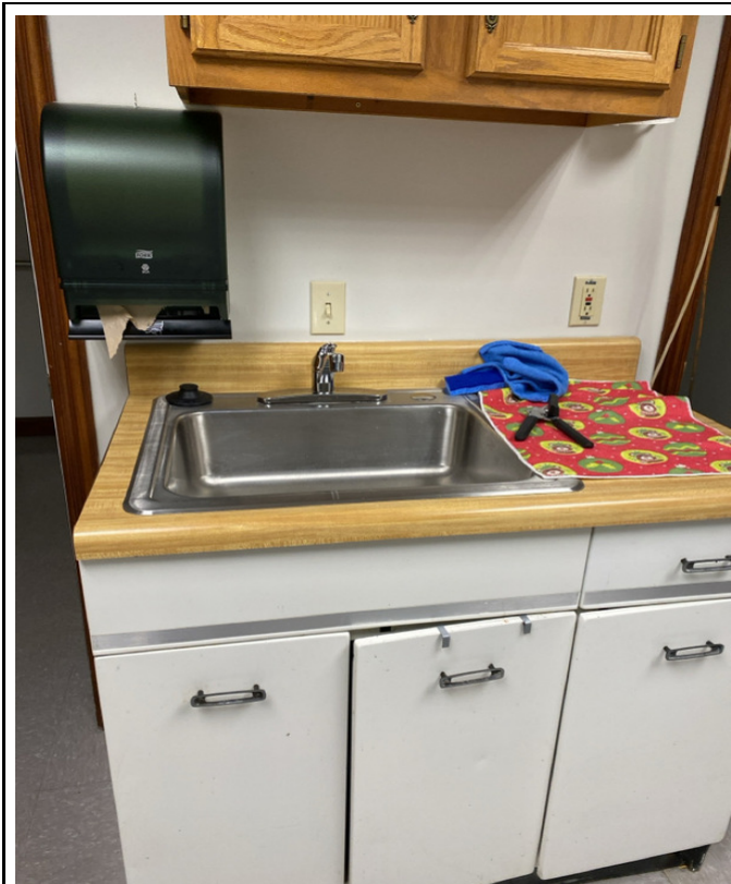
2/7/2024 - 318-1 - Admin Building - Kitchen