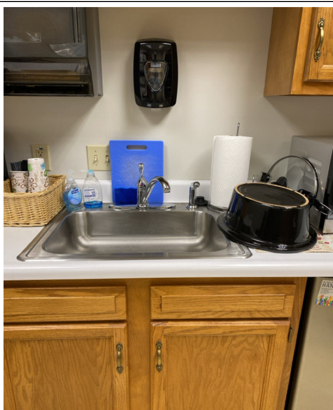
2/7/2024 - 318-2 - Admin Building - Workroom